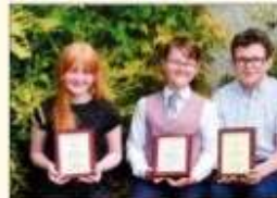
Fr Stephen Kearney Award - Newtownstewart