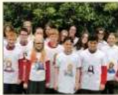
Fun the Flame - Buncrana