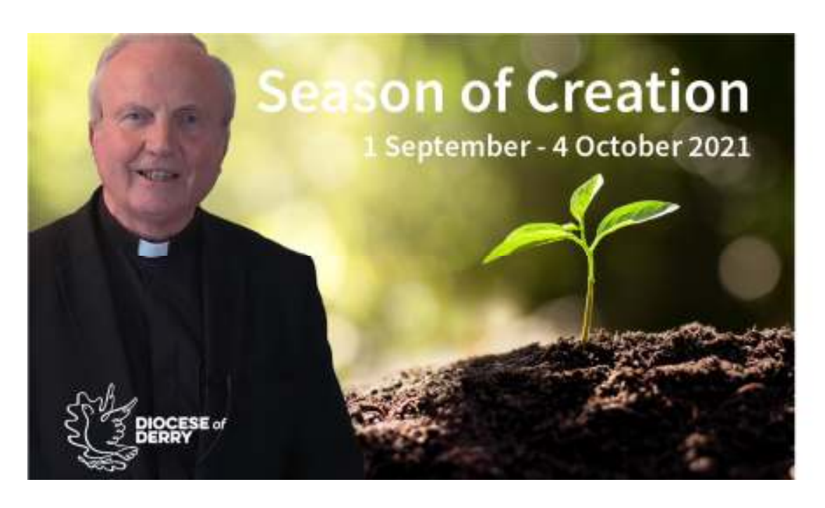
SEASON OF CREATION. "A Home for All?: Restoring Our Common Home"

Pope Francis established 1st September as World Day of Prayer for the Care of Creation following the publication of the encyclical Laudato si' in 2015. The Season of Creation or Creation Time, is marked throughout the Christian world from 1st September to 4th October (Feast of Saint Francis of Assisi), celebrating the joy of creation as well as encouraging awareness-raising initiatives to protect the natural environment.