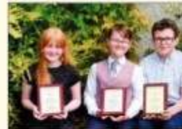
Fr Stephen Keamey Award - Newtownstewart