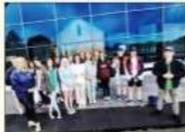
Derry Search pilgrimage - Knock