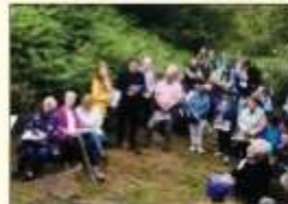
Mass Rock celebration - Glanaghlan

"They that wait upon the Lord shall renew their strength. They shall mount up with wings as eagles; they will run and not grow weary, walk and not grow weak". (Isaiah 40:31)