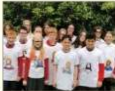
Fun the Flame - Benmore