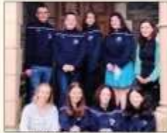
Youth Scholarship - Derry