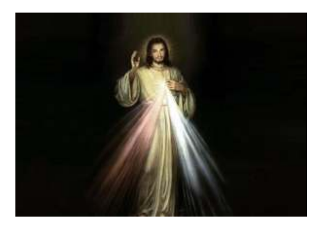
Today (Sunday, 11th April) is Divine Mercy Sunday

The four requirements to obtain the full plenary indulgences are;